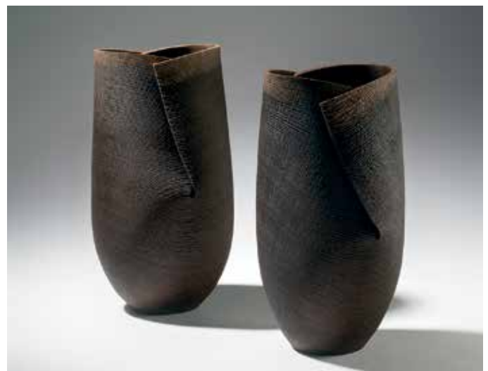
(Left) Dearcán Diptych #157, 2024, Oak, clear and white oil, 21\frac{1}{2} " × 14" (55cm × 36cm)

(Right) Dearcán Diptych #133 & #134, 2024, Sandblasted, fumed, and oiled oak, Taller: 1334" × 9" (35cm × 23cm)