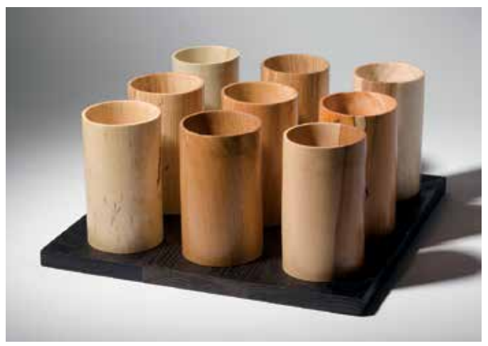
Containment, 2013, Birch, elm, holly, beech, apple, oak, cherry, yew, ash, 7½" × 15¾" × 15¾" (19cm × 40cm × 40cm)