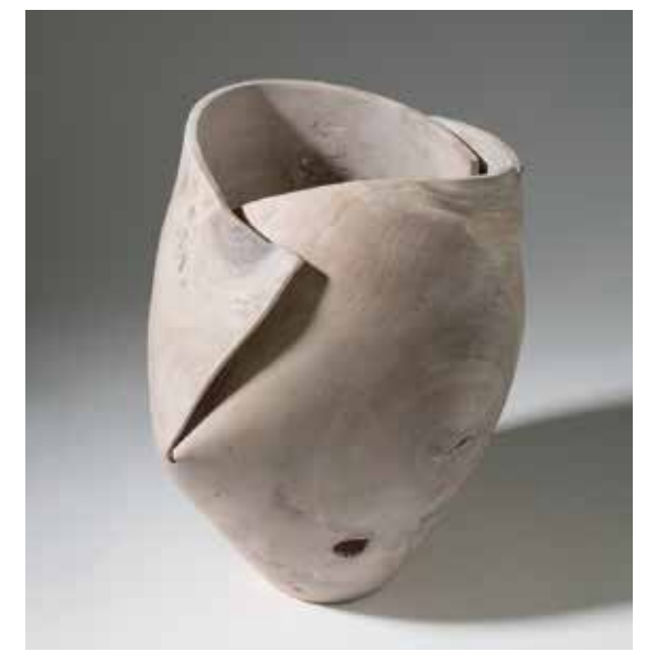
Leamhan Diptych #162, 2024, Elm, white oil, 10^{3} /4" × 9" (27cm × 23cm)