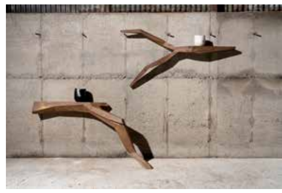
Residual Geometry V (table) and Residual Geometry VII (shelf), 2024, Fumed and sandblasted oak, Table: 79cm × 175cm × 45cm; shelf: 79cm × 160cm × 18cm

from the intimacy of a handheld vessel to the industry of a large-scale modular wooden seating structure that needed to be assembled, disassembled, and reassembled in multiple civic spaces. The architect Stephen Tierney, with whom Alan has collaborated on a number of projects, notes, "It is this back-andforth rhythm of working that permits a particular patience, each discipline refreshing the other and allowing momentary breathing space from what can become a claustrophobic intensity—then back to work, invigorated with a