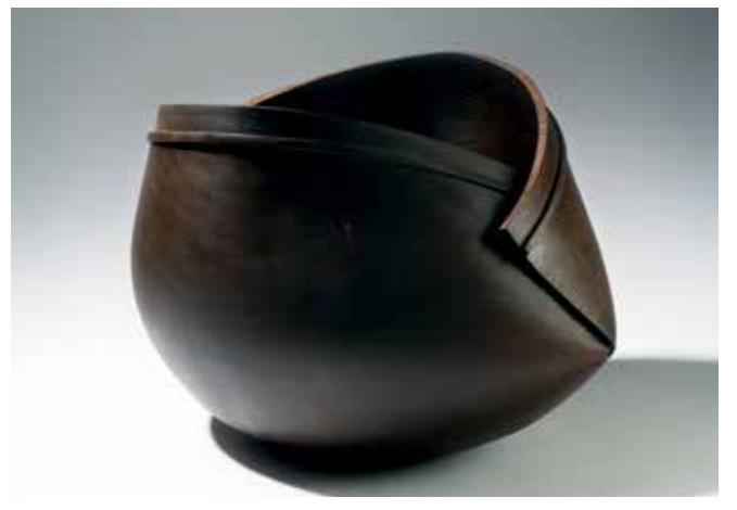
Dearcán Diptych #136, 2024, Fumed and oiled oak, 11½" × 17" (29cm × 43cm)

Alan Meredith's work to date has straddled the boundaries of contemporary